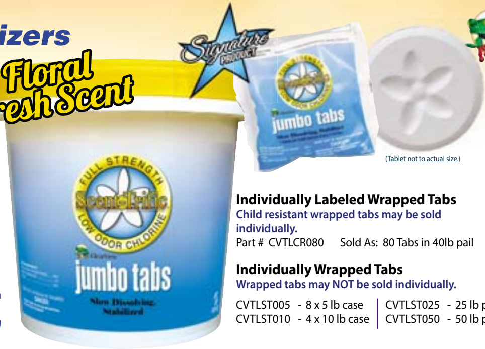
(Tablet not to actual size.)